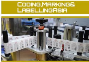
CODING, MARKING & LABELLINGASIA