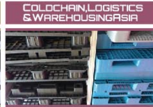
COLDCHAIN, LOGISTICS & WAREHOUSINGASIA

Printech Asia is a dedicated event for converting, package printing and labelling held in-conjunction with ProPak Asia. For more information please go to www.printechasia.com